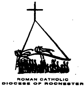
ROMAN CATHOLIC DIOCESE OF ROCHESTER

Our General Synod last October identified five priorities for the Church of Rochester to develop and have strategies underway as we approach the year-2000. Lifelong religious education clearly emerged as top priority and challenges us to think about and implement faith formation in new and creative ways.