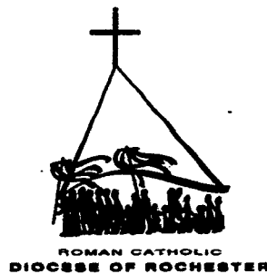
ROMAN CATHOLIC DIOCESE OF ROCHESTER

Just a year ago we convened as a diocesan family at our Synod to affirm our direction for the next several years. The proclamation of lifelong religious education as a primary focus and goal for us was heartwarming. It speaks of our concern that we all grow in faith and understanding of the mystery we share.