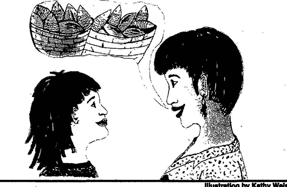
Illustration by Kathy Weish

Then the Lord said to Moses, "Hold your cane over the water of the river