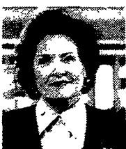
Louise Slaughter Member of Congress

Unified coordinated effort is the one real hope we have. Hand to hand, block by block, together we can turn this community around.