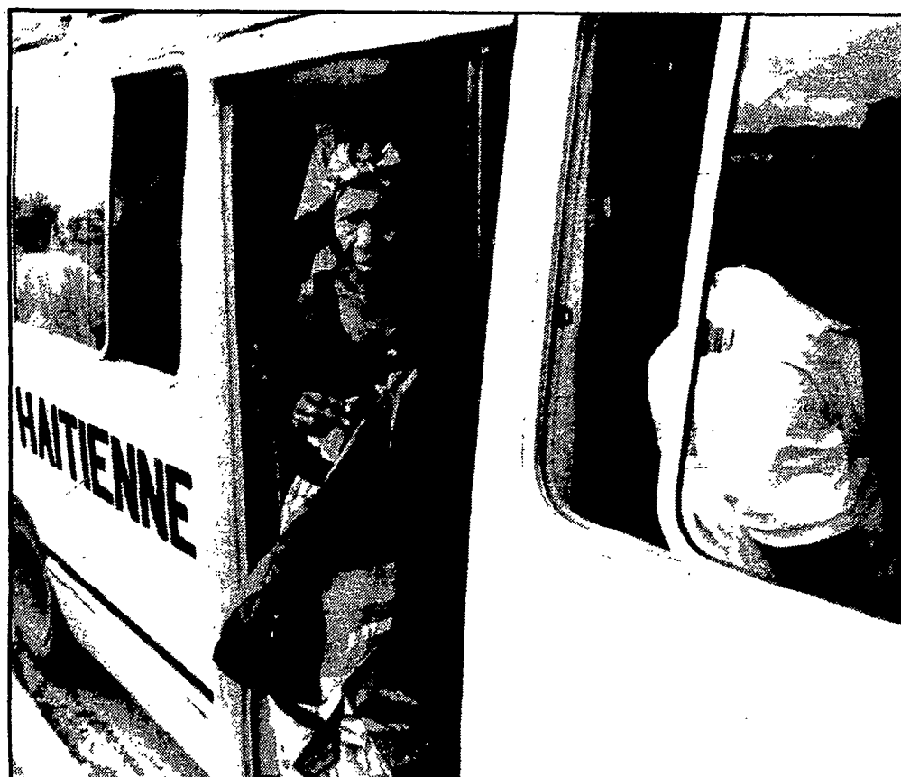
Haitian refugees returned by the U.S. Coast Guard leave a Red Cross bus in Port-au-Prince May 13. A Coast Guard cutter turned back 277 boat people to Haitian authorities in the first repatriation since President Bill Clinton altered U.S. refugee policy.

For the last two years, the Coast Guard has been under orders to patrol international waters outside Haiti and turn back any boats carrying Haitians trying to escape from their homeland. Under a change announced May 8, the INS now will prescreen Haitians stopped at sea for eligibility to apply for asylum.