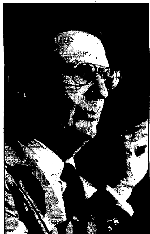
Father Charles Curran

Which brings us to the implementation of the diocesan Synod's theme regarding Catholic Moral Education. The adult Lenten Series on Conscience and Morals (began) locally on Feb. 20. To select as a principal speaker a controversial theologian, Rev. Charles Curran — judged by the Vatican Congregation for the Doctrine of the Faith as neither