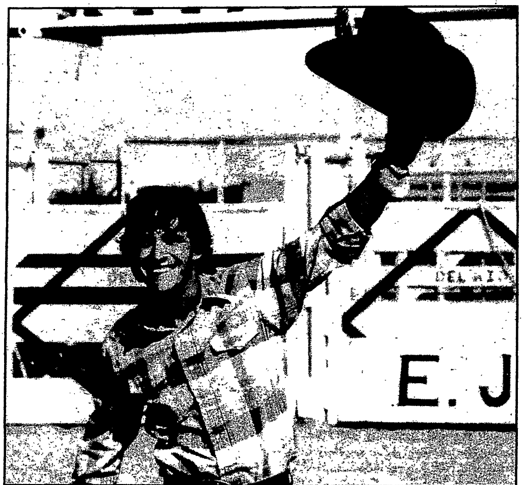
New Line Cinema Luke Perry Stars as Lane Frost in New Line Cinema's action-drama, 8 Seconds .