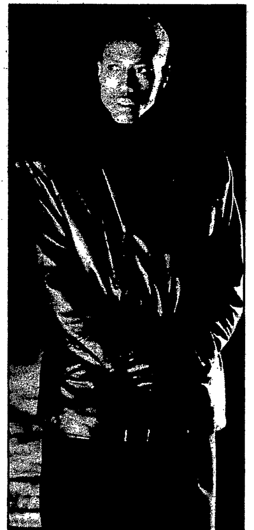
Wesley Snipes stars as Roemello Skuggs in Sugar Hill.

Wanting to begin an honest life down South with his love (Theresa Randle), a