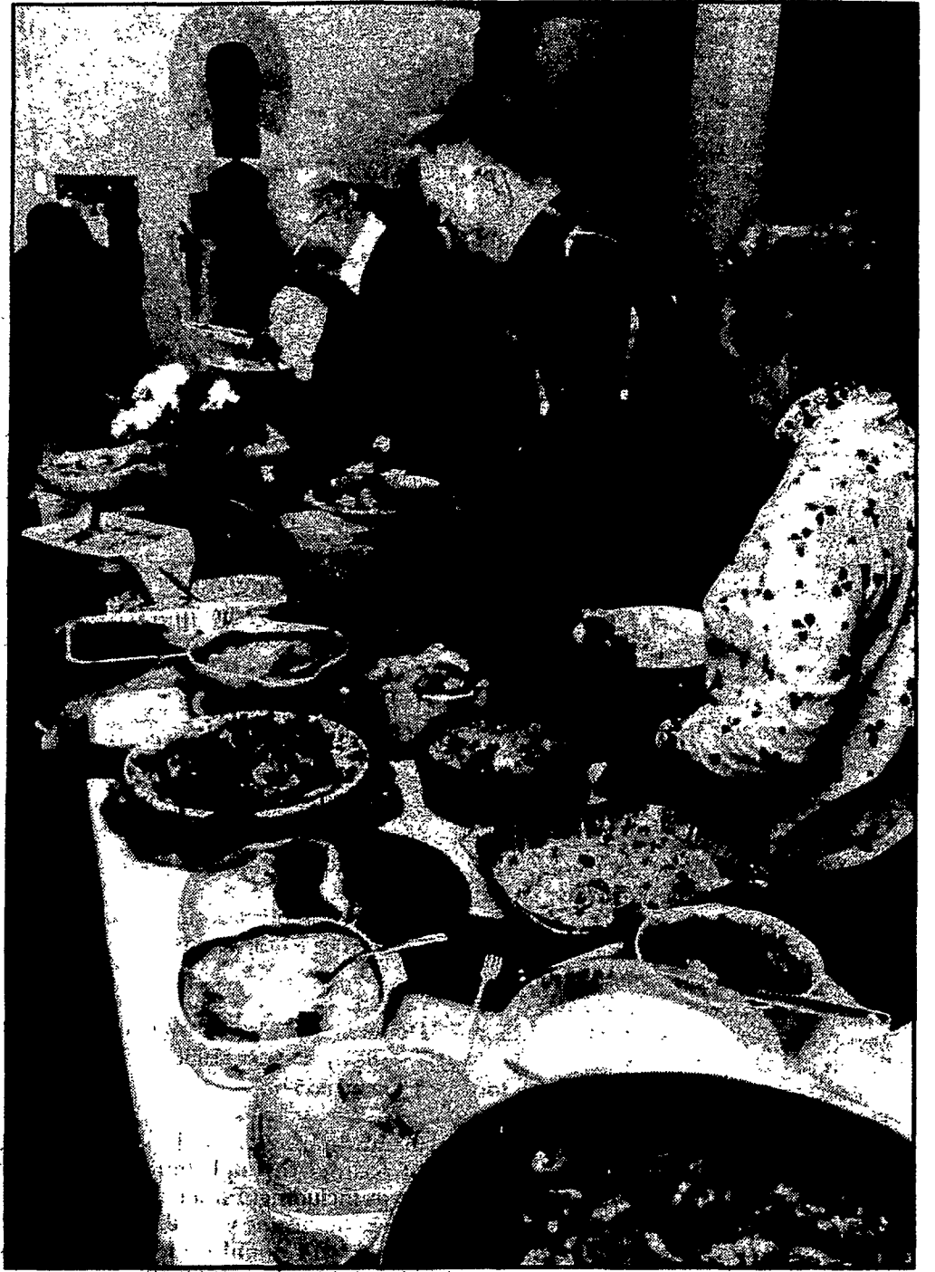
Parishioners of St. Francis and St. Felix churches attended a Feb. 15 potluck supper, held at the St. Francis parish hall.