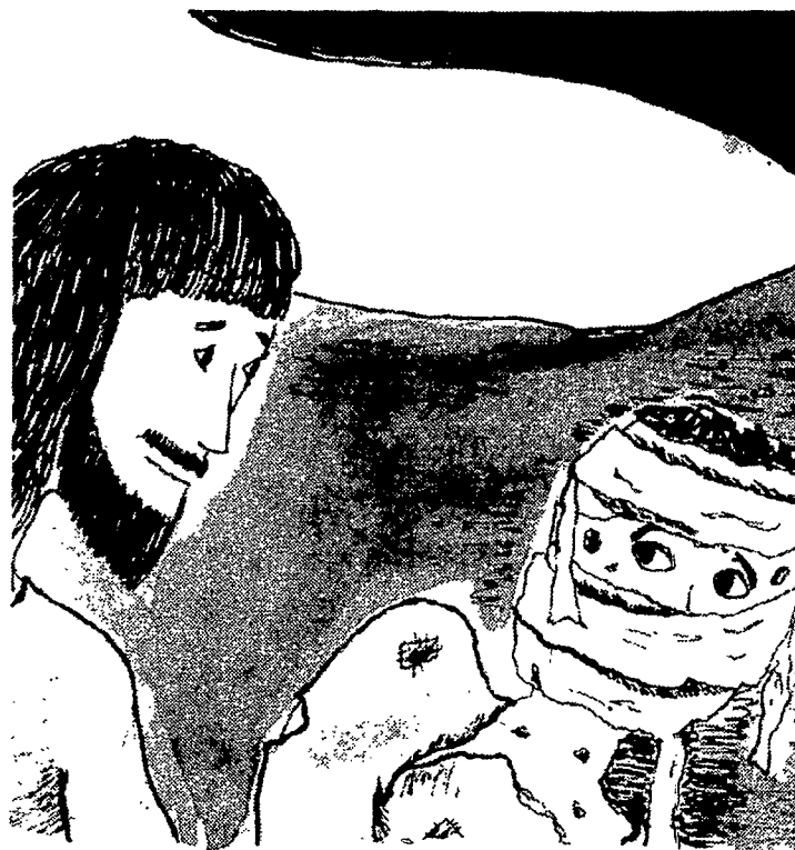
Illustration by Kathy Welsh

short time in deserted places, when he came out people immediately recognized him and crowds again formed around him.