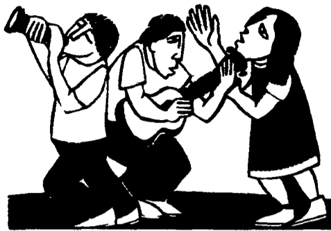
EST Christmas Day.

EWTN will show a Spanish Christmas Eve Mass taped at the Cathedral of San Fernando in San Antonio from 5 to 6 a.m.