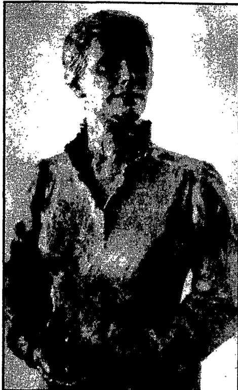
Sister Catherine McAuley, foundress of the Sisters of Mercy.