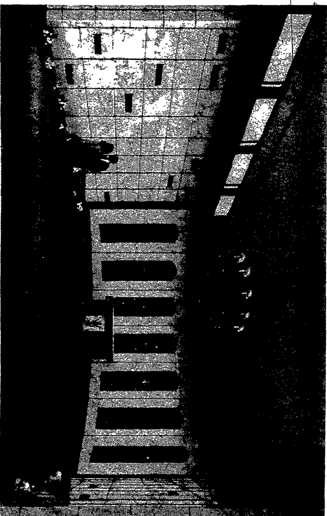
All Saints Mausoleum Chapel