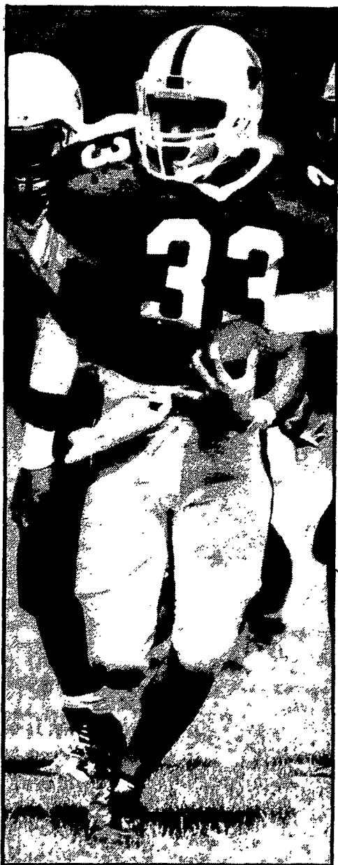
AQ running back Gabe Bauza carried the ball 21 times for 149 yards.

but suffered a dropped touchdown pass and a fumble on the Braves' 4-yard line.