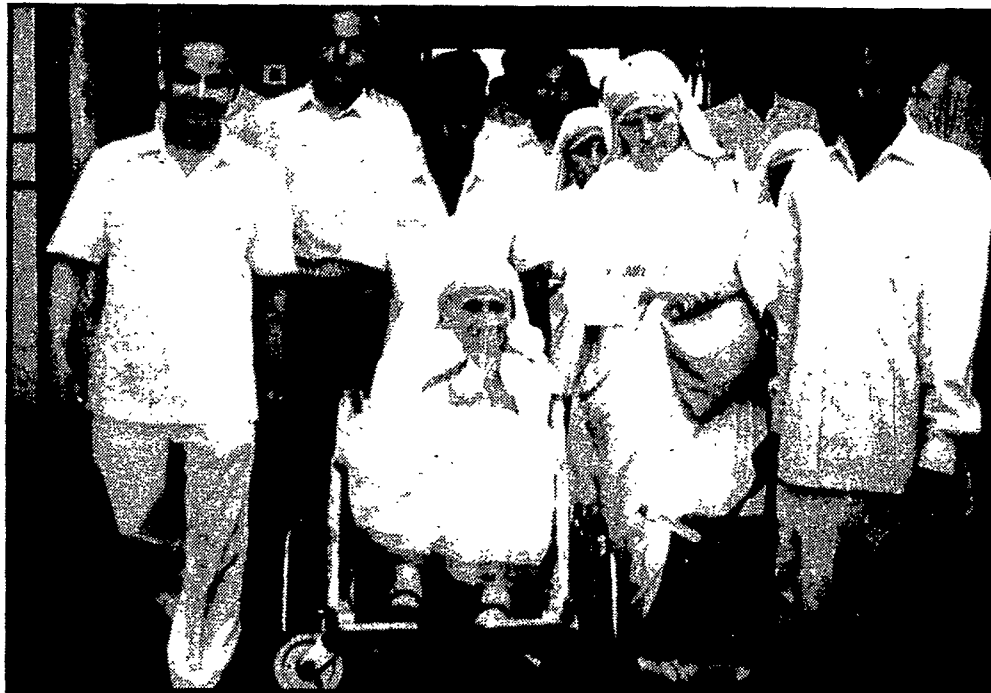
Mother Teresa greets well-wishers as she leaves a New Delhi hospital on her 83rd birthday Aug. 27. The Nobel laureate has returned to her Calcutta home after spending a week in bed with malaria.

Mother Teresa got out of bed Aug. 26 for the first time since Aug. 20 to take a walk in the coronary care unit of