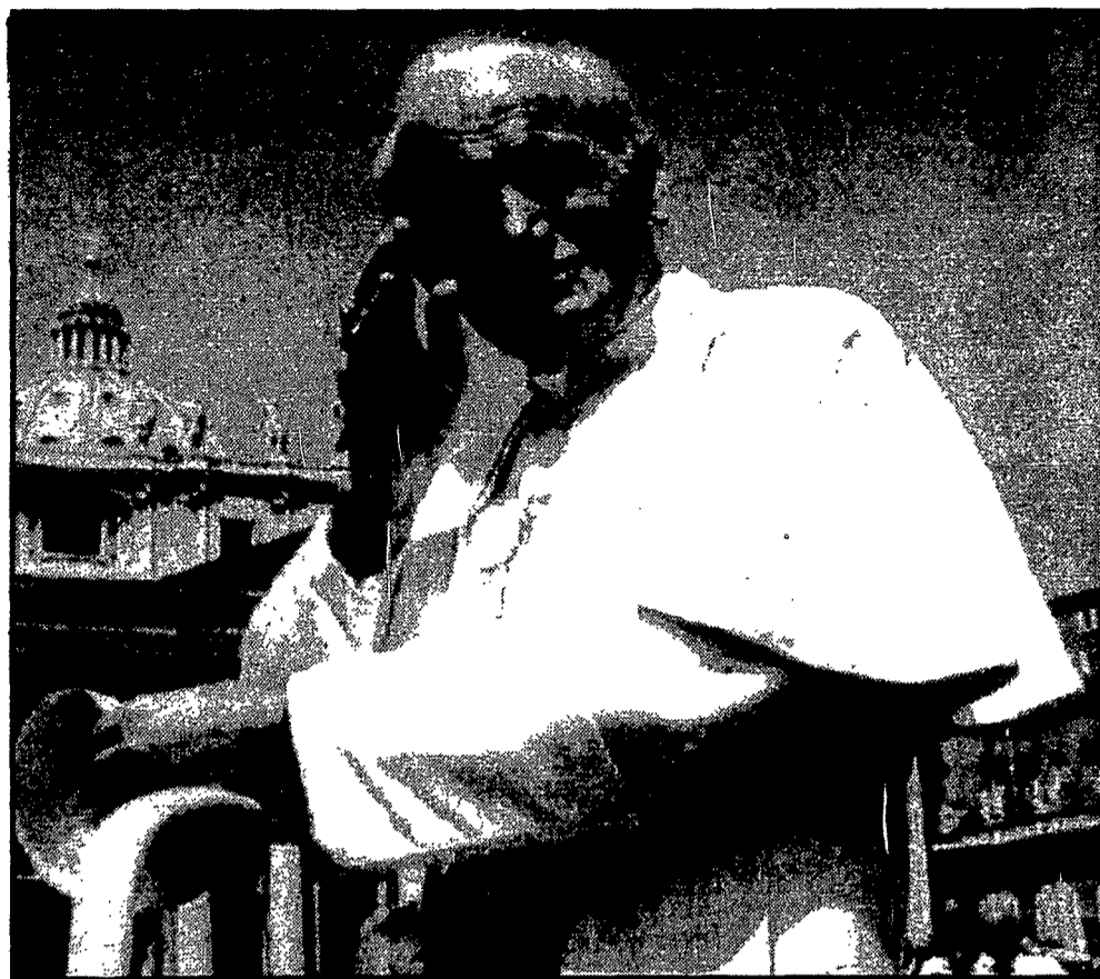
Pope John Paul II, shown here outside St. Peter's Square in Rome, is scheduled to visit Denver for World Youth Day '93. The international Catholic youth celebration will be held Aug. 11-15.

This story contains some information from Catholic News Service.