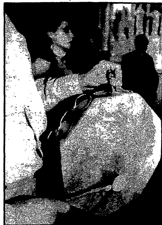
A drum is used to keep time.