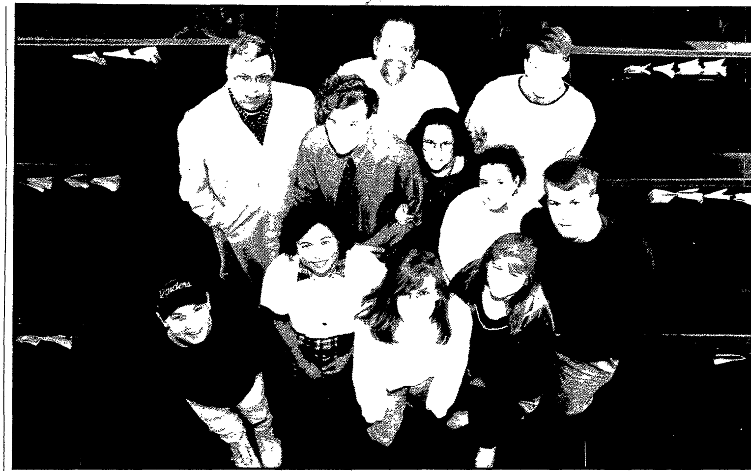
Next month these youths and adults from All Saints Church in Lansing, St. Catherine's Church in Ithaca and Lansing United Methodist Church are slated to travel to Puerto Rico, where they will help rebuild structures ravaged by Hurricane Hugo in 1990.

In addition, the dozen volunteers will visit a shelter in the Puerto Rican capital of San Juan.