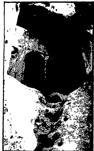
Rock Chapel Cappadocia, Turkey