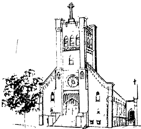
St. Casimir's Church

The facility, which is located in the church basement, includes four pews and two priedieus (or kneelers) to accommodate a total of between 25 and