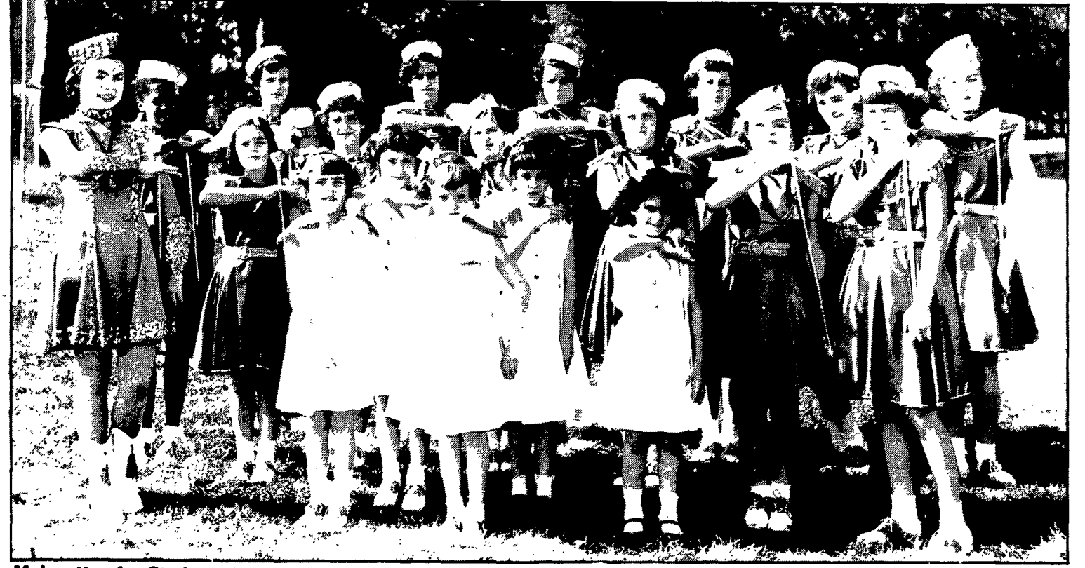
Majorettes for St. Joseph's Villa gathered for this photo in 1951.