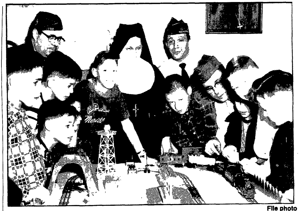
Children gather around a train set presented to St. Joseph's Villa by the Culver Post Veterans of Foreign Wars in 1955.

male, who come from 32 counties in western and central New York. Clients are referred to the agency through family courts, social service departments, and school districts. These organizations also provide a majority of the Villa's funding, with the remainder coming from community donations and grants.