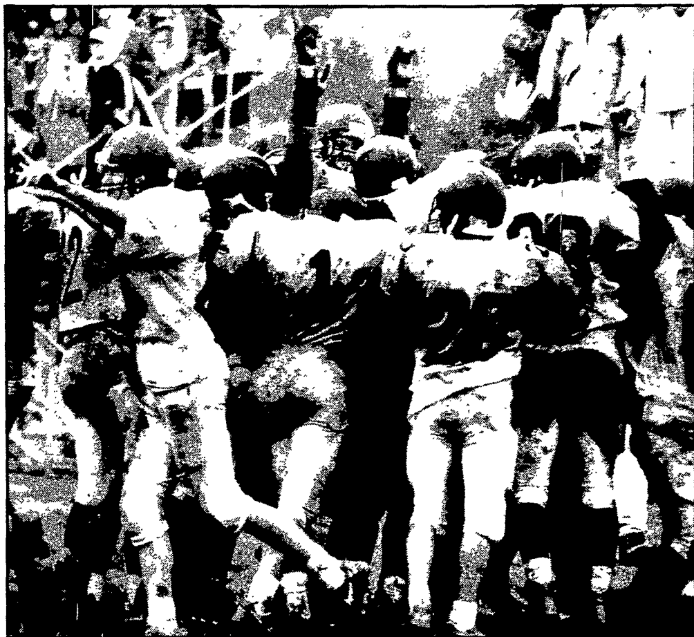
After their 13-0 win, drenched and muddy McQuaid players celebrate their victory over the host Little Irish Oct. 24.