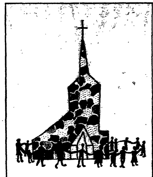
In addition to reflecting the theme of the diocesan Synod, a church banner marks the Spencerport parish's 125th anniversary.

But the end of anniversary celebrations won't quell the fire of sacramental and Marian devotion that expresses itself most of all in the religious shop the parish operates in the church's