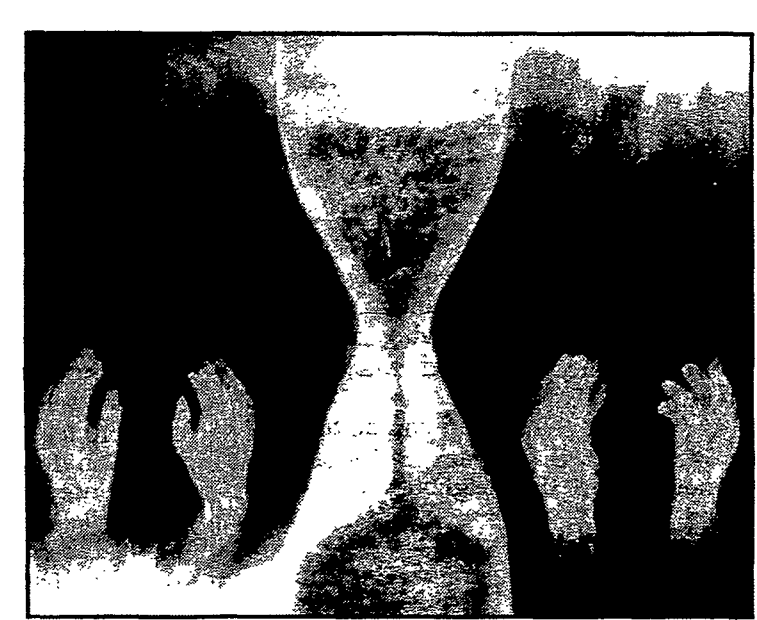
This painting deals with issues of greed (hands on the left) and charity.