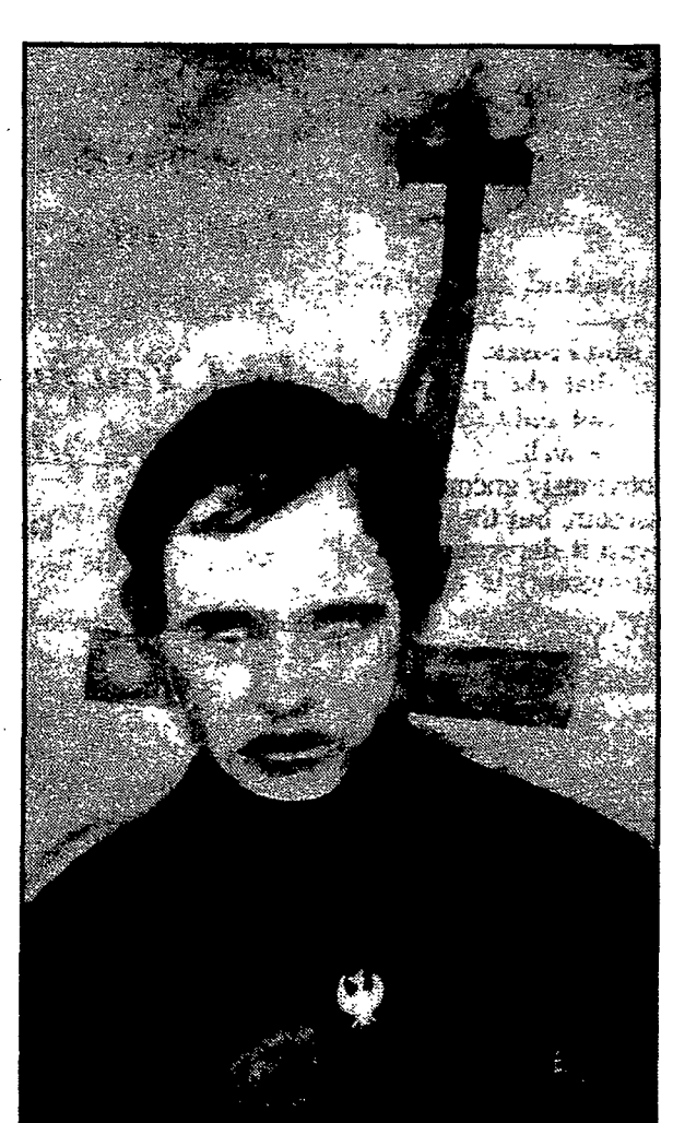
Father Jerzy Popleluszko was murdered by Polish security police in 1984.