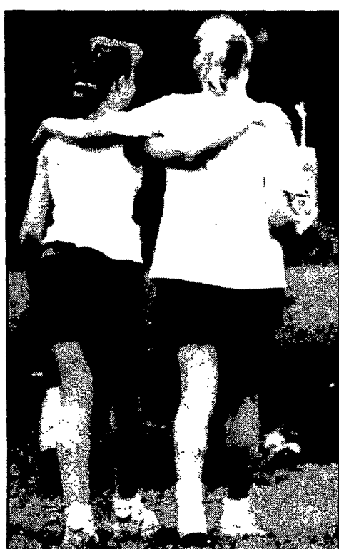
Two members of Mercy's crosscountry team embrace after the Class A seeded race. The Monarchs finished ninth as a team at the annual invitational.