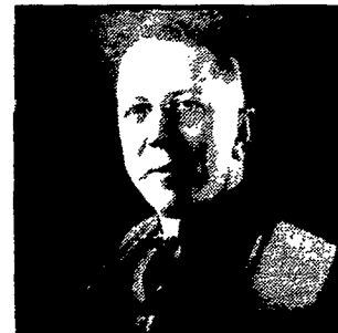
Edward Cardinal Mooney • Installed 1933 • Transferred to Detroit 1937 • Created cardinal 1946 • Died 1958