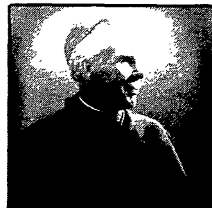
Bishop Fulton J. Sheen • Installed 1966 • Resigned 1969 • Died 1979