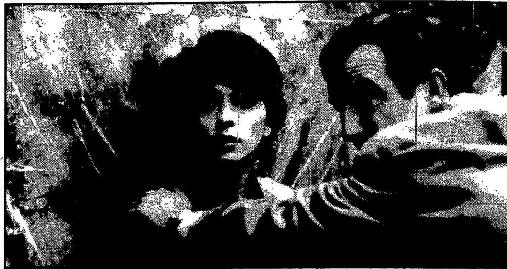
New York City psychiatrist Dr. Ann Hecker (Annabella Sciorra) becomes suspicious that her lover Doug McDowell (Jamey Sheridan) may have murdered one of her patients in Paramount Pictures' Whispers in the Dark .

save the world, but this movie is another matter.