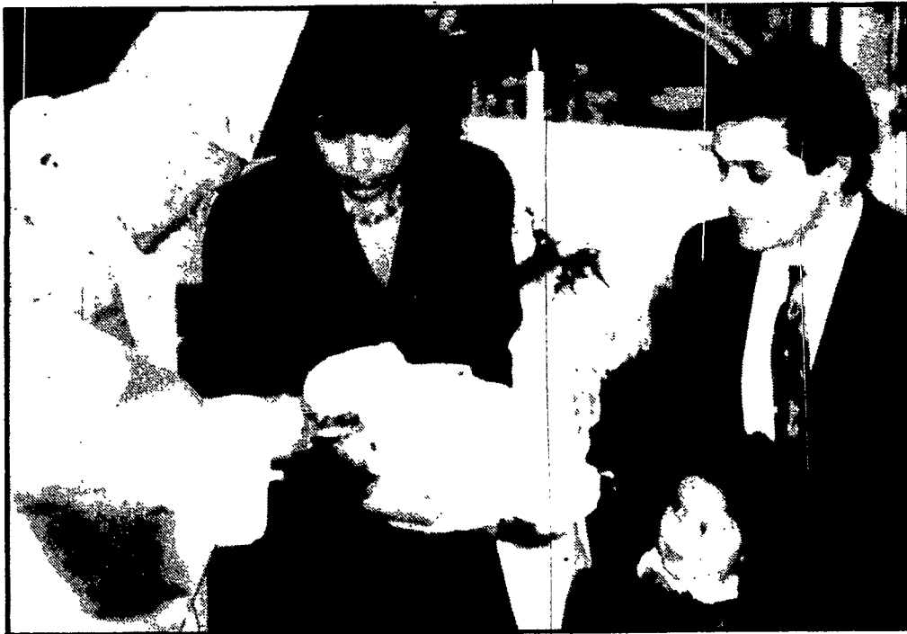
File photo Pope John Paul II baptizes a small child Jan. 7, 1990, in ceremonies at St. Peter's Basilica.

In general, he said, the sacrament of marriage helps couples grow in holiness. In particular, it gives them grace to stay faithful to each other in permanent unity, he said.