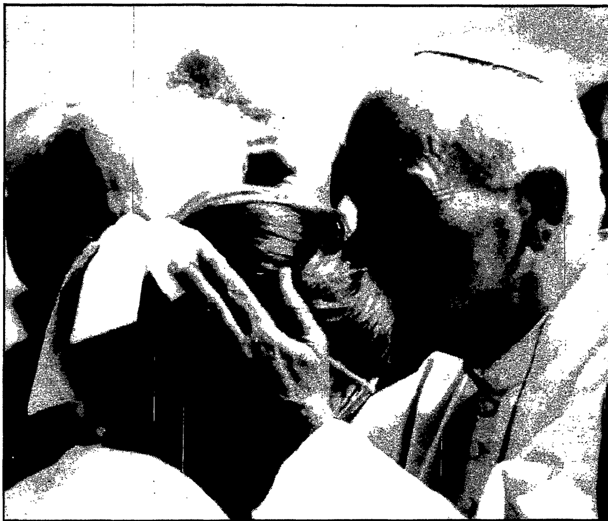
Pope John Paul II, shown here kissing a young girl on the forehead as he arrives in Budapest, Hungary, in 1991, recently approved the final text of the "Catechism and the Catholic Church."