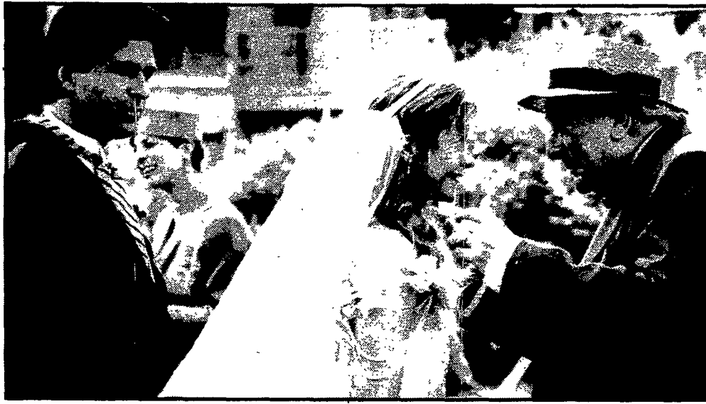
Alec Baldwin (left) is Peter, Meg Ryan is Rita and Sydney Walker is Julius in Prelude to a Kiss , a fable about love.

Although their relationship is never given any depth beyond their flush of first love, Peter and Rita make a handsome couple. Perhaps the movie is too busy trying to be a romantic comedy to do justice to more substantial themes like affirming the transcending power of love to see past appearances. In any event it is an airy summer mo-