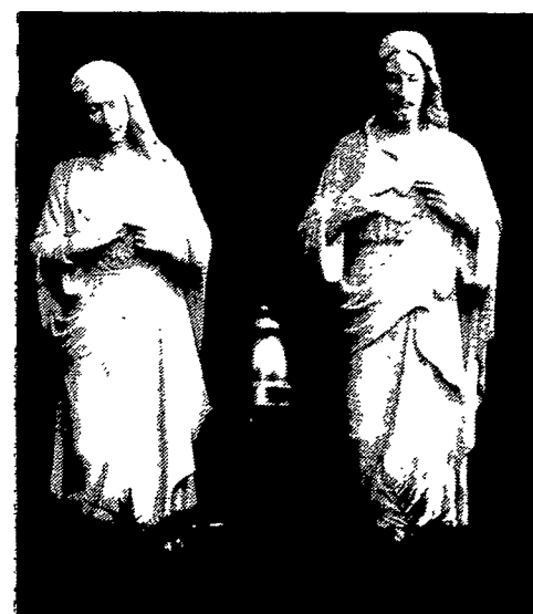
These marble statues were imported from Italy for the shrine.

a statue to honor the Sacred Heart," Shea observed.