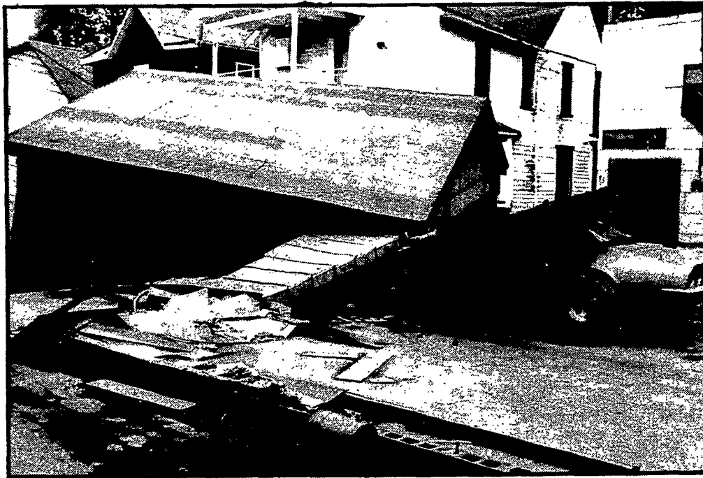
Although the U.S. Department of the Interior reported that damage in New York state totaled more than $850,000,000, fortunately no lives were lost.