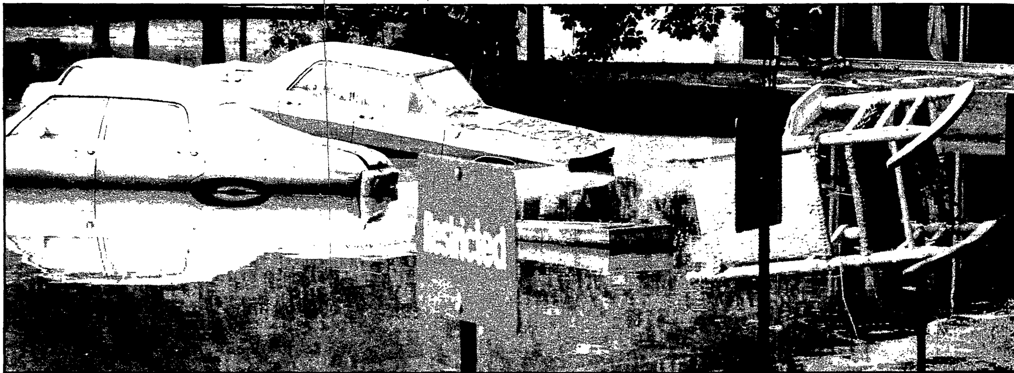
Many homes were lost and streets flooded when Tropical Storm Agnes battered the Southern Tier in late June 1972, making it one of the hardest-hit areas in the eastern United States. File photo