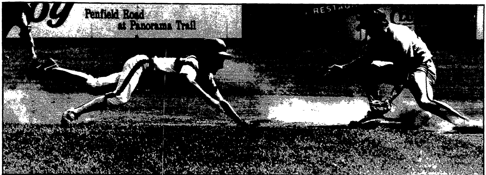
Todd Hardy of DeSales attempts to pick-off Prattsburg's Nate Loesch during the Section 5 Class D final at Silver Stadium June 13.