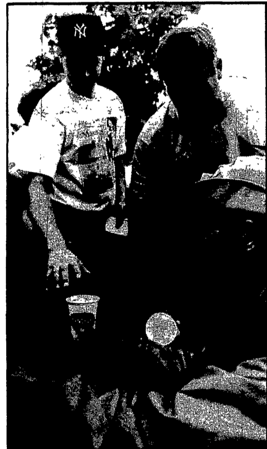
A volunteer (right) provides two marchers with water at a checkpoint.