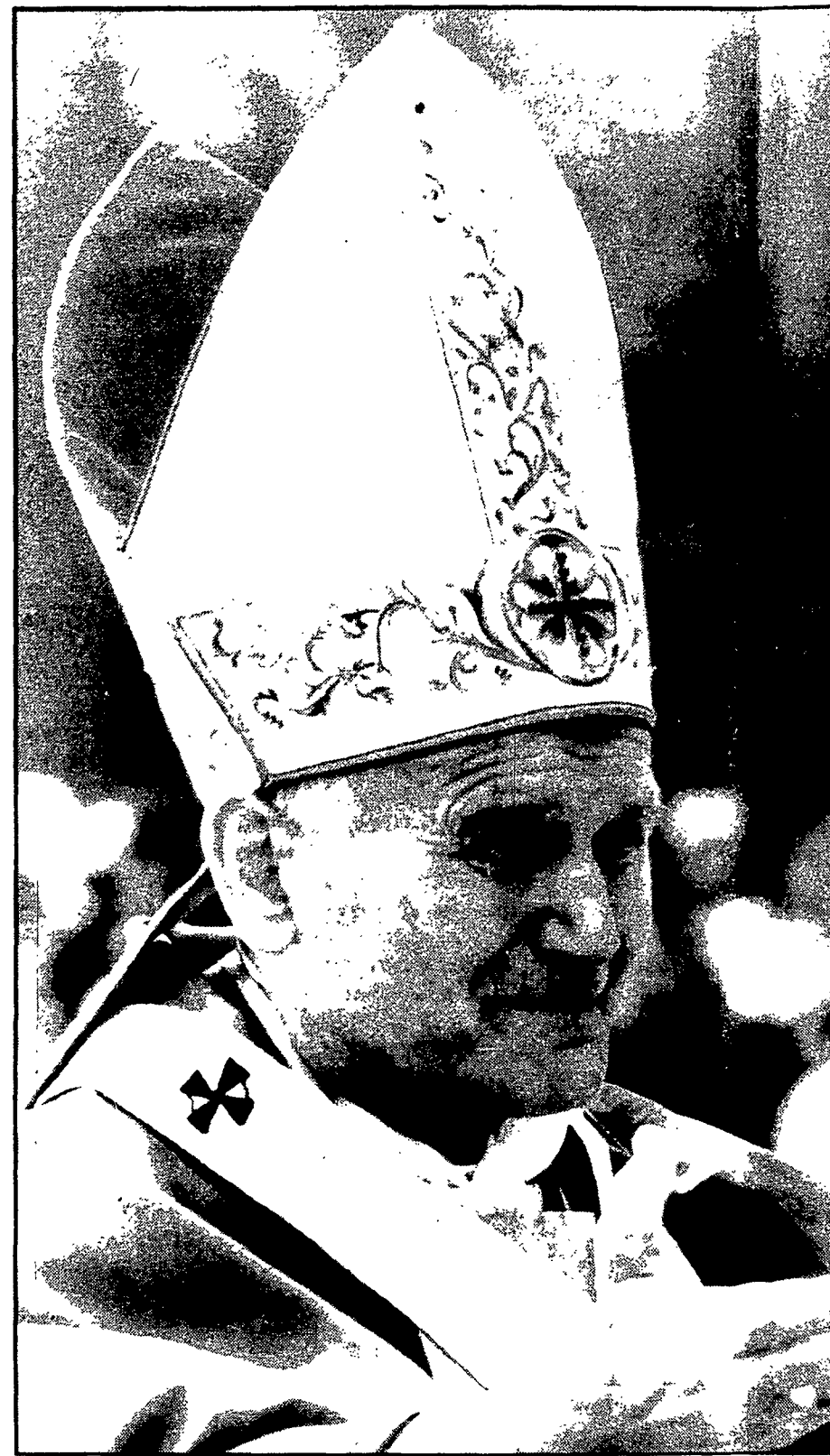
Pope John Paul II called for new initiatives to stem the decline in vocations in his 1992 World Vocations Day message, which was released at the Vatican on May 10, 1992.

The church, in the course of its history, has always been enlivened and supported by many men and women religious, witnesses of unlimited love for the Lord Jesus, while in times closer to us has found valid assistance in many consecrated person that, living in the world,