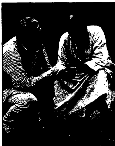
Missionary in Tanzania