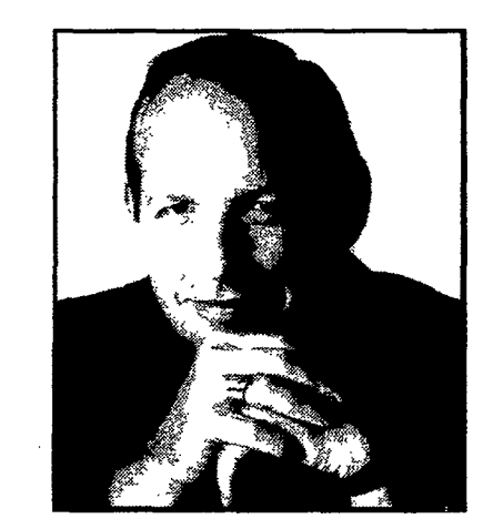
LONG THE WAY

I remember those days of preparation with