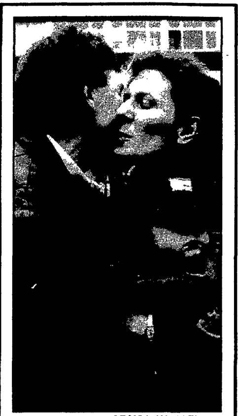
GERMAN EVACUEES — Members of the German community in Sarajevo, Bosnia-Herzegovina, kiss while waiting April 9 at the local Volkswagen plant to be evacuated on buses. Under armed guard, 21 Germans — many who worked at the plant — departed with other nationals for the Serbian capital of Belgrade.

In the second draft that use of such quotations was significantly reduced, and in the third draft they disappeared in favor of paraphrases.