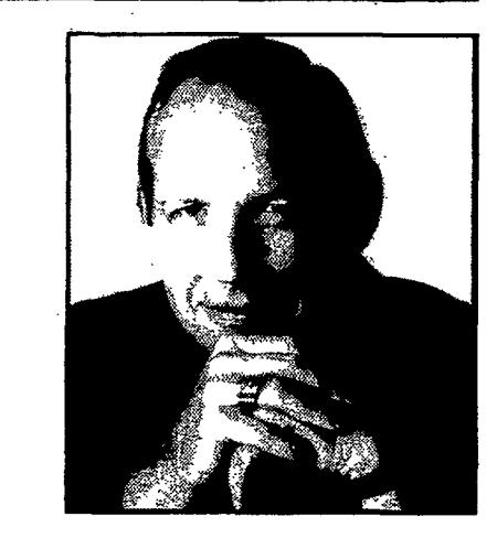
LONG THE WAY

— if they contain enough open-ended issues. We'll ask the generous DPC members if our committees have fulfilled their task of (a) presenting the current situation in our 12-county