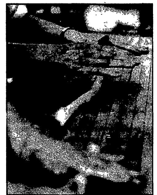
Preparations the March 15 event began the previous day.

ADULT ED: "The Ingredients of an Intimate Relationship;" St. Mary's