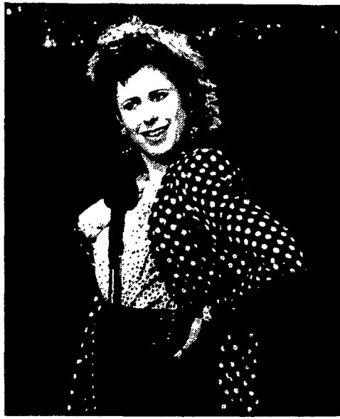
Julie Kavner stars as Dottie Ingels, whose daughters must cope with their mother's meteoric success as a stand-up comic in This Is My Life.

their mom. But the lure of near fame and fortune wears thin when mom's never around for them, especially when Erica is in the throes of adolescent angst. Mom's unexpected romance with Moss makes the girls feel even more left out, so much so that they leave for Albany, and the dad they barely remember.