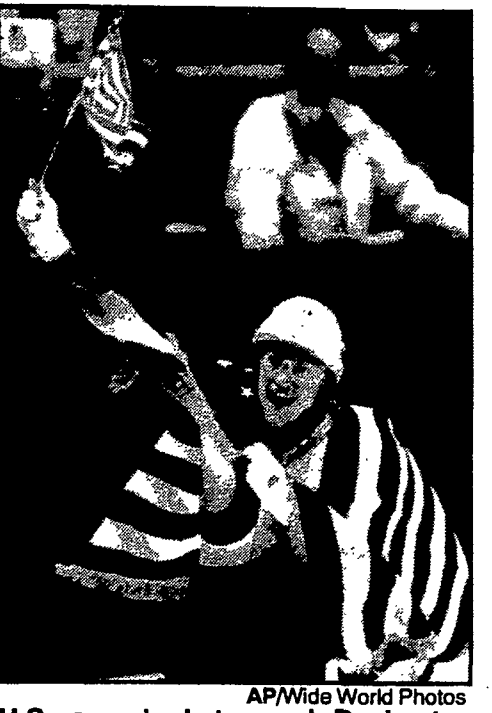
U.S. speed skater and Rochester native Turner skates draped in an American flag after winning the gold medal in women's 500-meter short-track speed skating at the XVI Winter Olympic Games in Albertville, France Feb. 22.