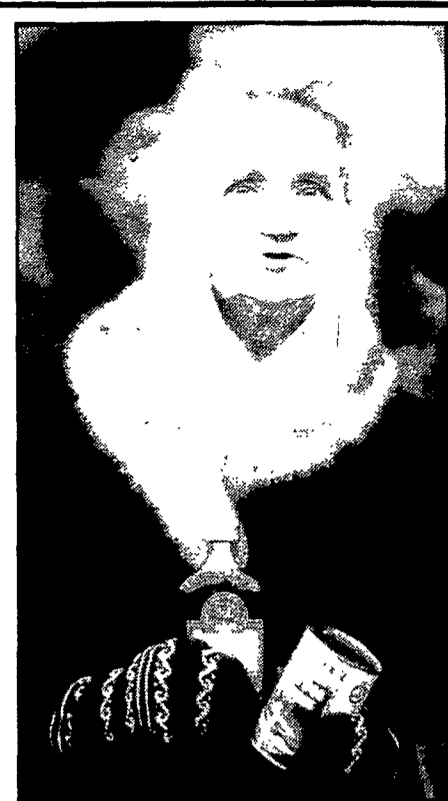
SELLING AID — A woman in Moscow Feb. 26 holds a can of Dutch hot dogs, part of the European Community's food relief to Russia, along with a bottle of cognac. Russia has been working to overcome the perception that humanitarian food aid from the United States and Europe eventually ends up on the black market.

A 1979 study by the U.S. bishops' Committee for Pastoral Research and Practices listed five distinct theological positions on the nature of confirmation. "No particular practice or theology seems to be able to claim a monopoly position," the study said.