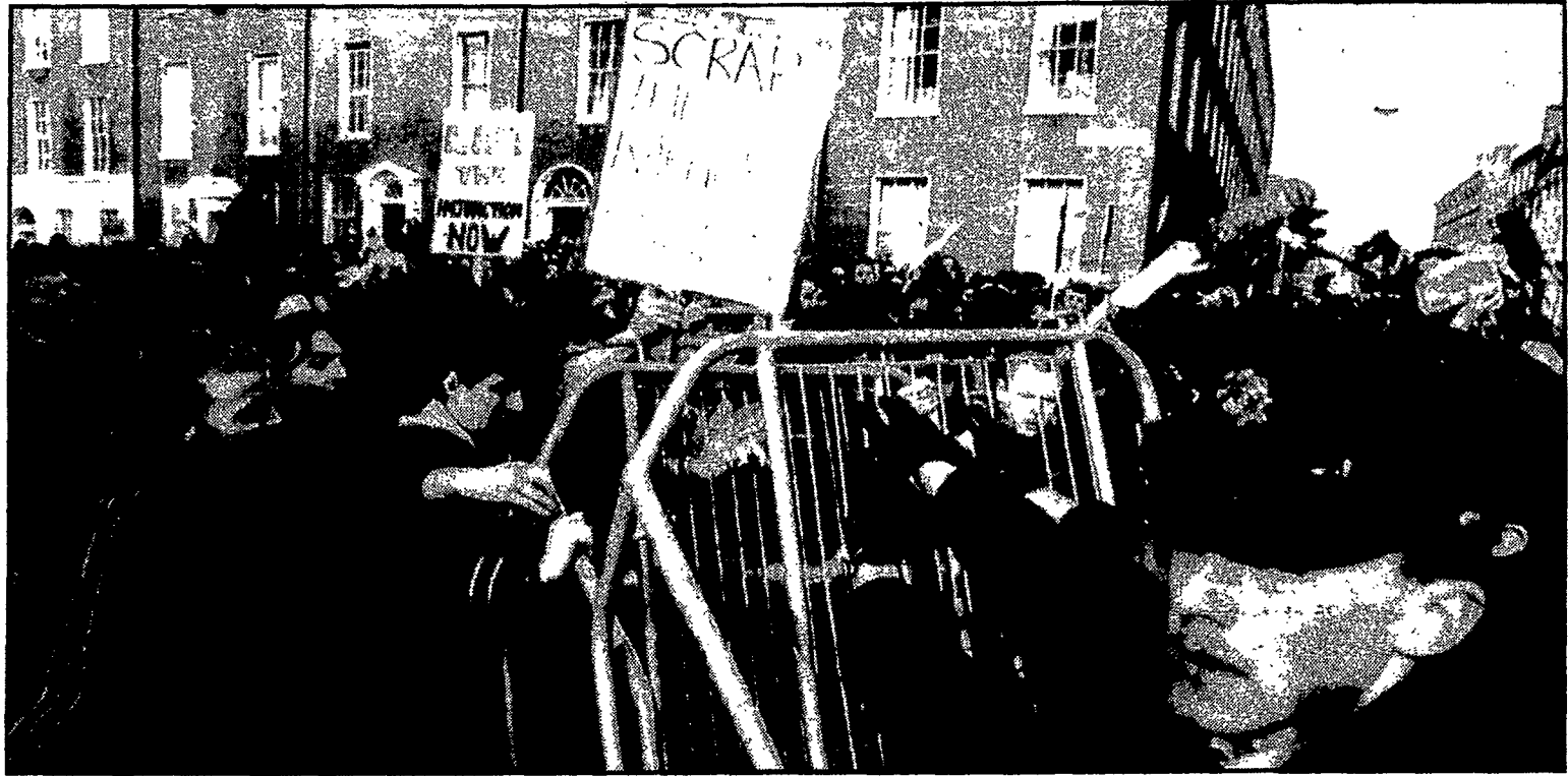
Police hold up metal barriers as protesters attempt to break through during a demonstration in Dublin Feb. 25. Around 300 people, mainly students, blocked streets outside the Irish Parliament to protest the Supreme Court of Ireland's decision banning a 14-year-old rape victim from having an abortion in England.

pastoral experience had left him with no doubt that rape "is one of the worst experiences that a woman can experience." The girl's age in this case makes her situation especially moving, he said.