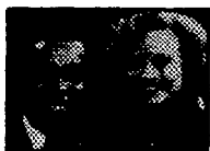
With Bobby Short & Juliet Prowse

Step back in time as world-class dancers kick up their heels to the Artie Shaw Orchestra and the hits of the 30's and 40's. EB