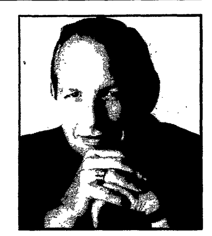
LONG THE WAY

3.) On Saturday, our board of St. Bernard's