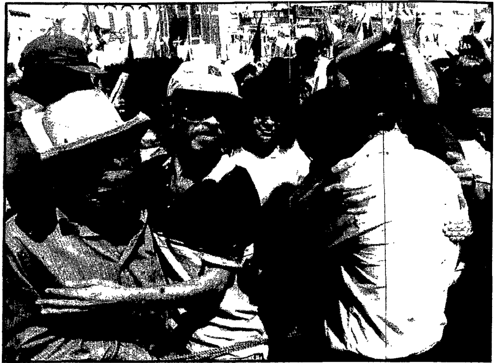
Salvadorans embrace and cheer in San Salvador Jan. 16, after peace accords in Mexico City ended the nation's 12-year-old civil war. Salvadoran President Alfredo Cristiani and representatives of the rebel Farabundo Marti National Liberation Front signed the accords on Jan. 16.

While the public celebrated the arrival of peace throughout the country, Salvadoran President Alfredo Cristiani assured news reporters in Mexico the war was over for good.