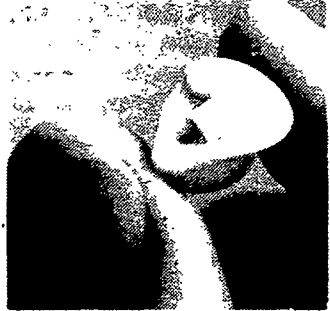
Magnatone's Stock Canal Model SCA