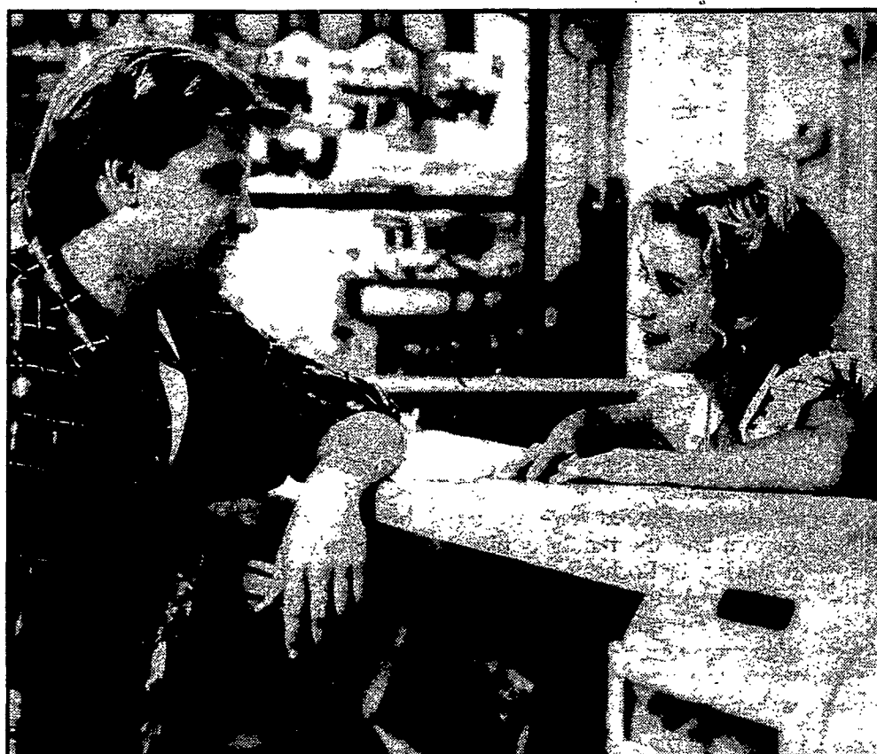
Demi Moore stars as Marina, a clairvoyant from North Carolina whose sudden marriage brings her to Greenwich Village, and Jeff Daniels is Dr. Alex Tremor, a psychiatrist who becomes aware of her uncanny influence on everyone in the neighborhood, in The Butcher's Wife.

Due to an implied lesbian relationship, mild sexual innuendo and an instance of rough language, the USCC classification is A-IV — adults, with reservations. The MPAA rating is PG-13 — parents are strongly cautioned that some material may be inappropriate for children under 13.