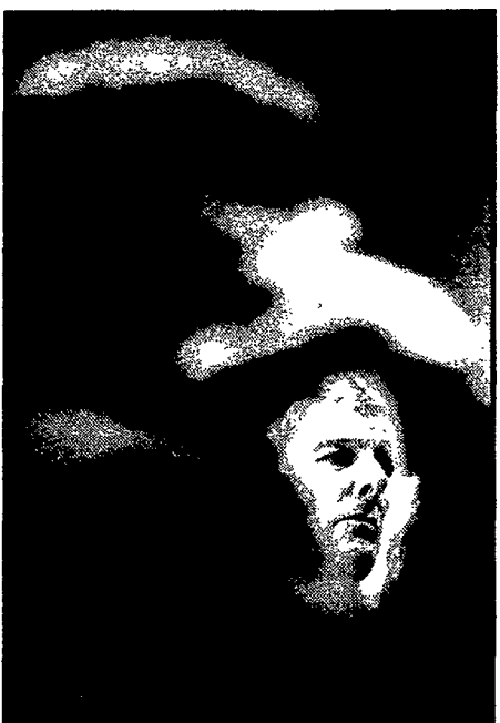
Cuomo's luncheon address, part of the National Health/Education Consortium Conference Day, drew about 300 attentive listeners.