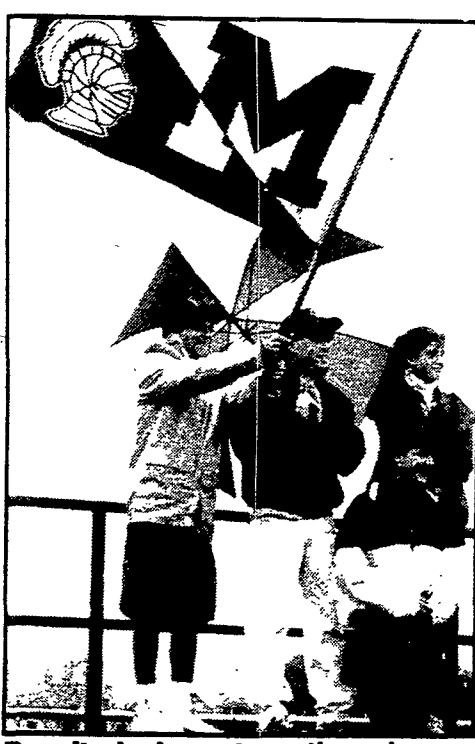
Despite inclement weather, dozens of McQuaid fans came out to cheer the host Knights.