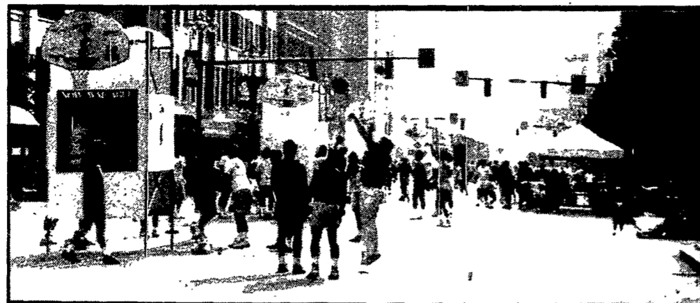
Players warm-up on the basketball courts lining Rochester's Main Street as they prepare to compete in the 1991 Jumpin' Jack Shootout Basketball Tournament July 20. A record 700 teams entered the downtown event this year.